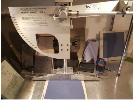
Image 2. Test surface