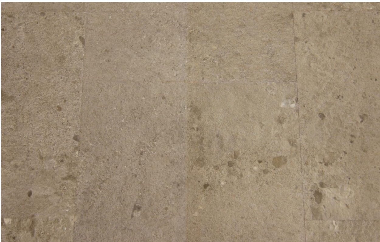
Figure 4: after 25 times wet-mopping with dyed PU Cleaner solution; on the left PU Anticolor satin, on the right unsealed