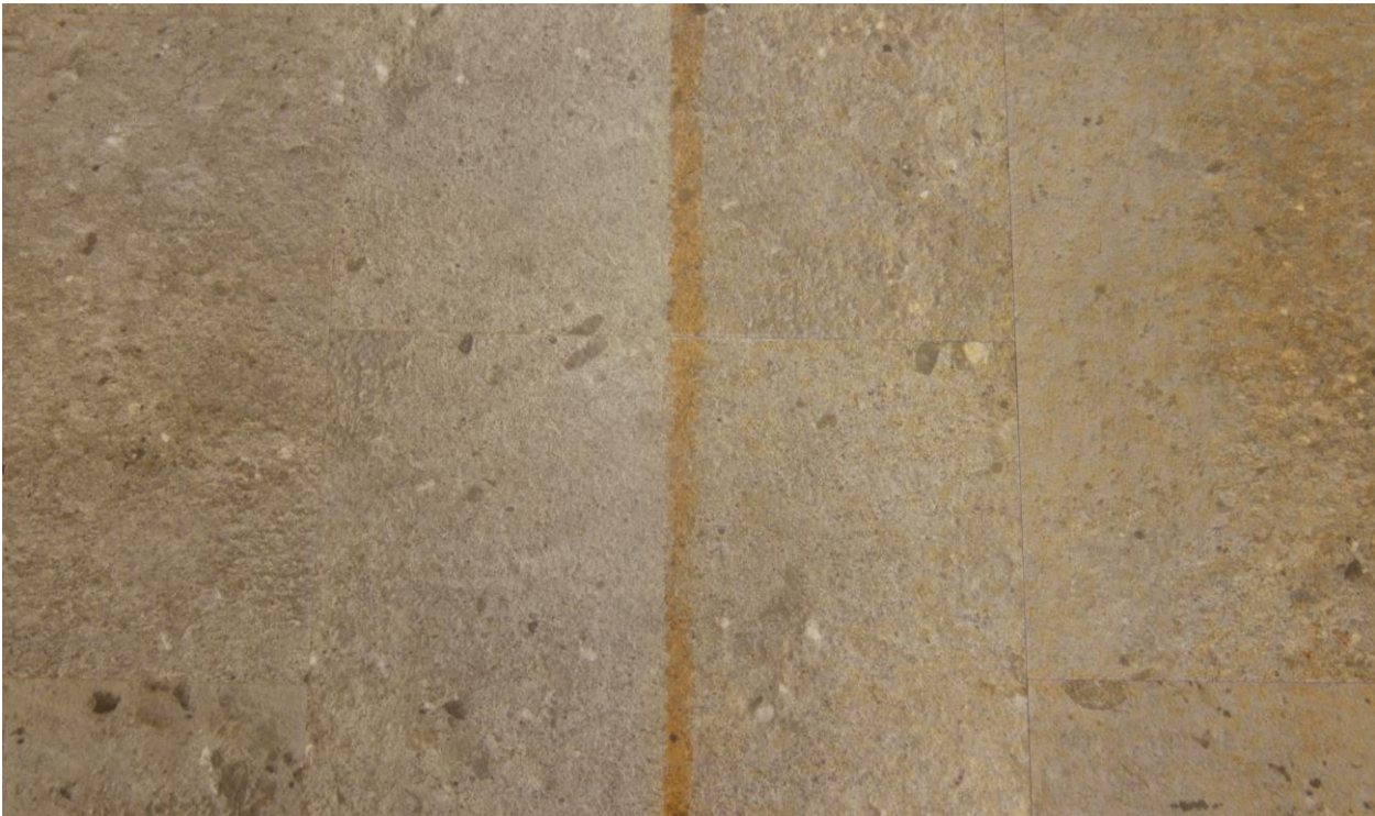
Figure 3: after 25 times wet-mopping with dyed Disinfectant Cleaner K solution; on the left PU Sealer satin, on the right unsealed

In addition to the waterproof closure of joints, the sealed test surfaces clearly show a lower soiling by the dyed treatment solutions, compared to the unsealed reference surfaces.