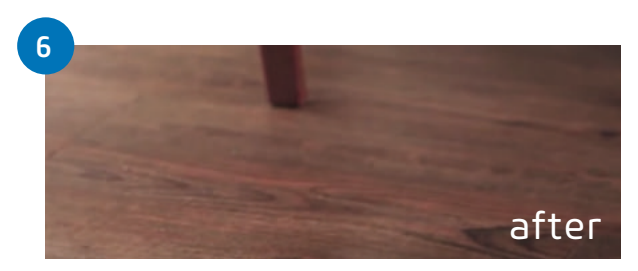
Problem solved Scratchfix hides/conceals scratches and white lines. It blends in quickly.