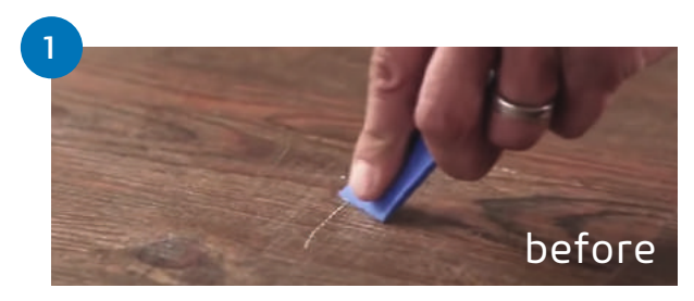
Preparation with Scraper Remove rough edges with plastic scraper.

Watch Scratchfix Kit in action: https://bit.ly/2NK38gq