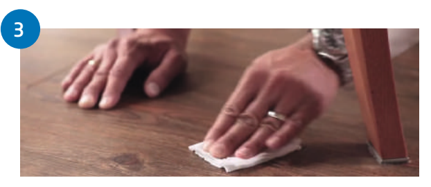
Preparation: Cotton Cloth Clean any debris off surface with clean cloth.