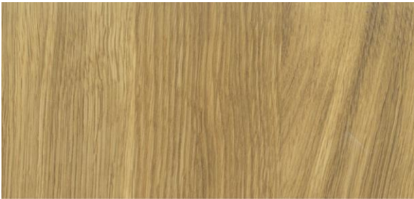
euku oil 1FS colorless